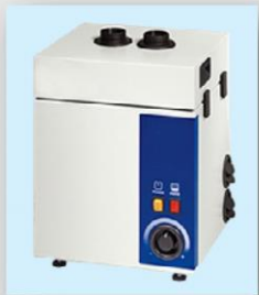
Laser fumes unit for 20W version