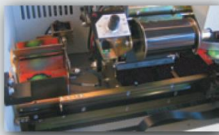
Internal tipping unit