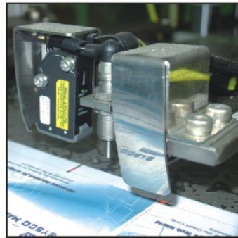
Laser sensor Registration mark tracking system