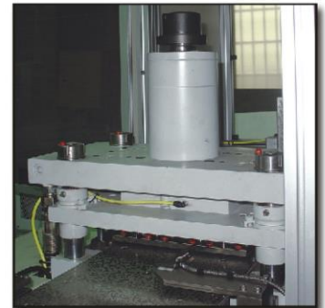
Hydraulic cutting system