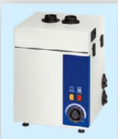
Laser fumes unit for 20W version